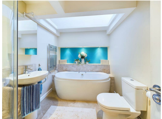
Bathroom 9'5" x 6'9"

Luxury bathroom with bath, walk-in shower, towel rail, WC, washbasin and recessed lighting. Limestone coloured tiled flooring.