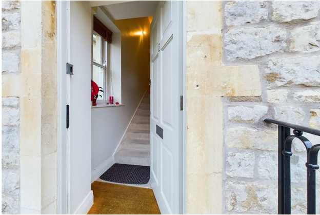
Hallway 5'5" x 6'2"

The maisonette is accessed at the rear of the property via iron steps and balustrade to the front door. This leads into a hallway with storage cupboard and stairs leading to the first floor.